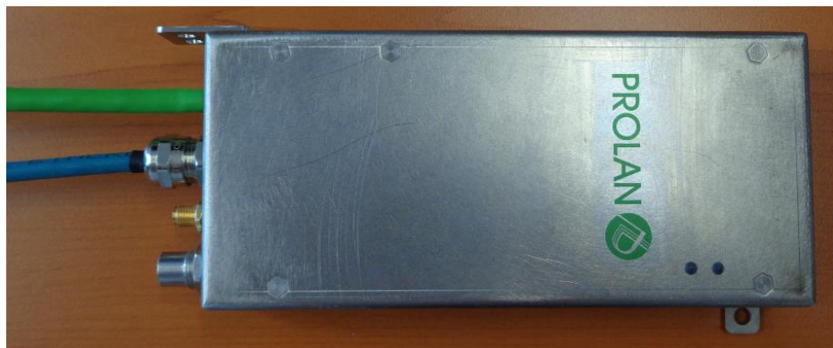
Fig. 1: LTE Modem top view [2]