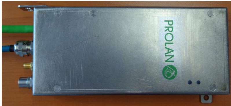
Fig. 1: LTE Modem “PEMG2-V2” [2]

on the evaluation of the fire protection properties of the LTE Modems “PEMG2-V2” of the company Prolan according EN 45545-2:2013+A1:2015